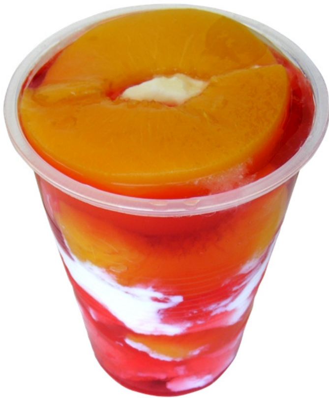
CD RO CDRO Copyright—John Austin © Australia 2017. Licence Personal Use AHP-A0-6/2015 Expiry date: 31 Dec 2019