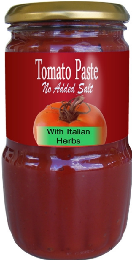
CDRO CDRO Copyright—John Austin © Australia 2017. Licence Personal Use AHP-A0-6/2015 Expiry date: 31 Dec 2019