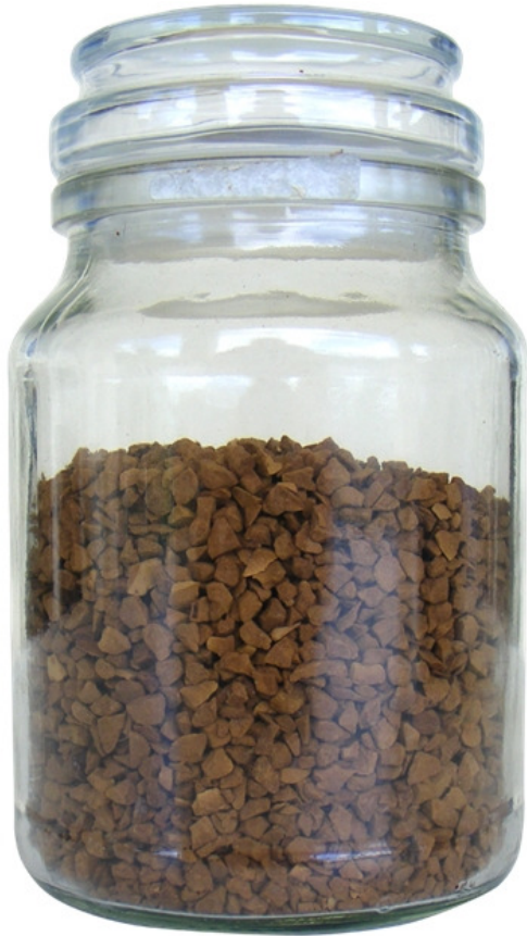
Freeze dried coffee

CDRO CDRO Licence Personal Use AHP-A0-6/2015 Expiry date:31 Dec 2019