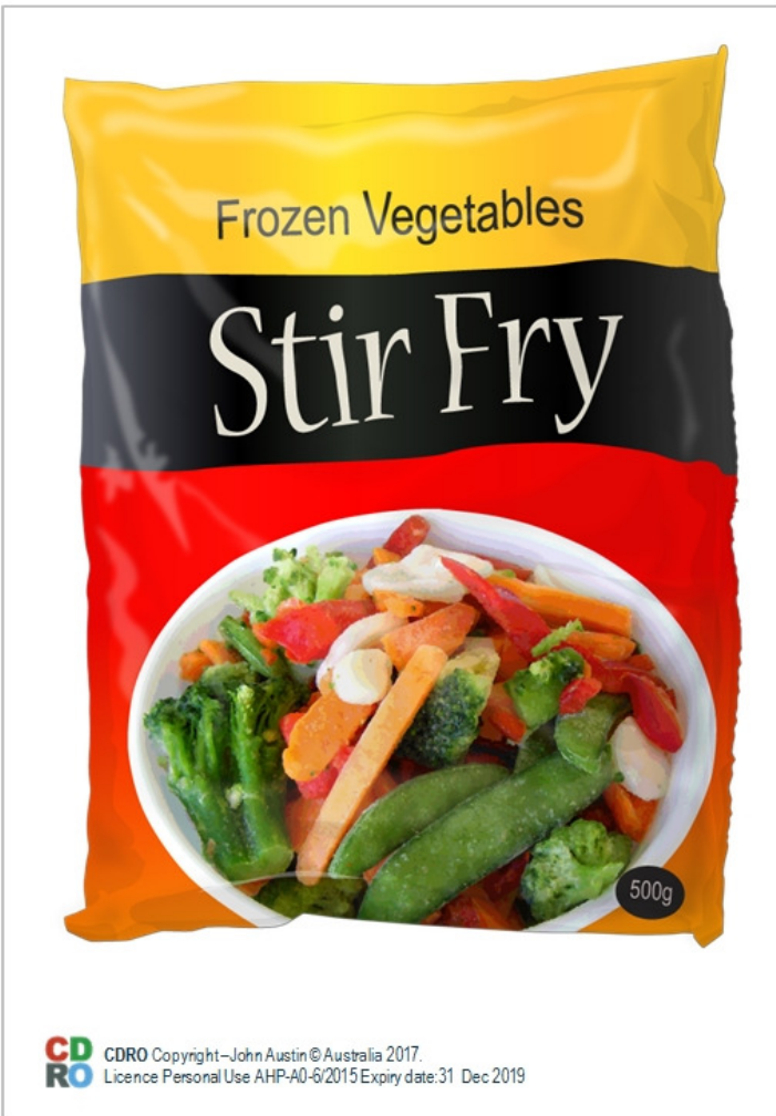
CD RO CDRO Copyright—John Austin © Australia 2017. Licence Personal Use AHP-A0-6/2015 Expiry date: 31 Dec 2019