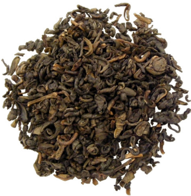
Loose Chinese tea

Licence Personal Use AHP-A0-6/2015 Expiry date: 31 Dec 2019