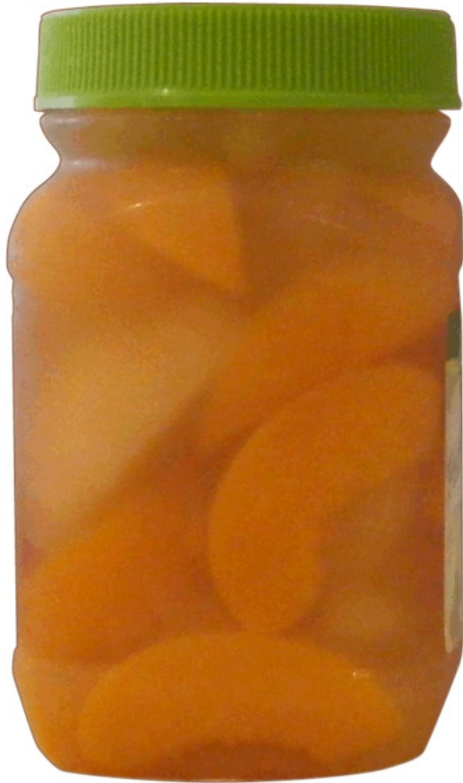
CDRO CDRO Licence Personal Use AHP-A0-6/2015 Expiry date: 31 Dec 2019