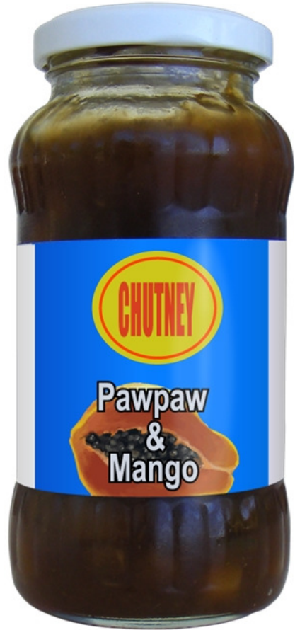
CDRO CDRO Licence Personal Use AHP-A0-6/2015 Expiry date: 31 Dec 2019