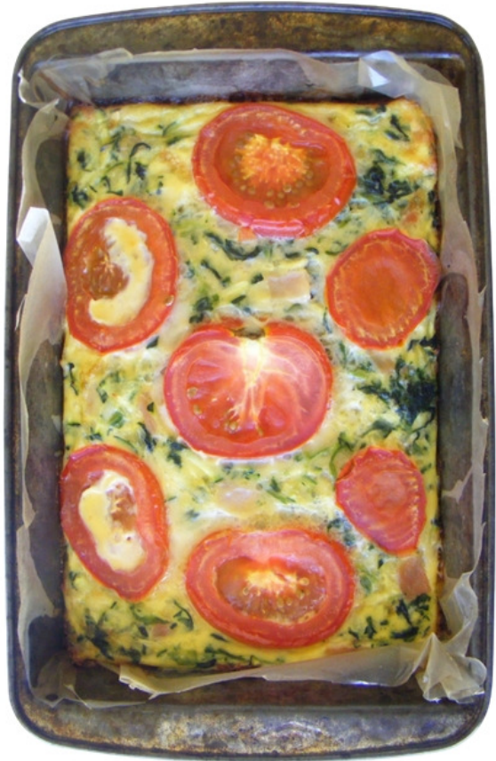
CD RO CDRO Copyright—John Austin © Australia 2017. Licence Personal Use AHP-A0-6/2015 Expiry date: 31 Dec 2019