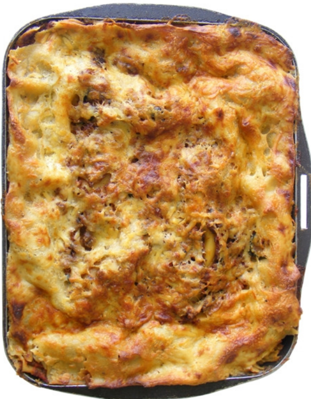
CD RO CDRO Copyright—John Austin © Australia 2017. Licence Personal Use AHP-A0-6/2015 Expiry date: 31 Dec 2019