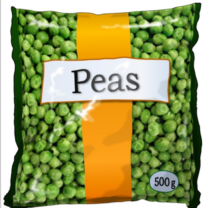
CD RO CDRO  Licence Personal Use AHP-A0-6/2015 Expiry date: 31 Dec 2019