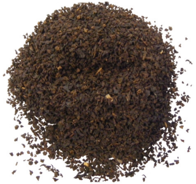
Loose Indian tea

Licence Personal Use AHP-A0-6/2015 Expiry date: 31 Dec 2019