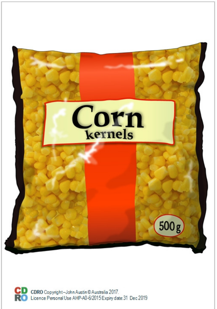
CD RO CDRO  Licence Personal Use AHP-A0-6/2015 Expiry date: 31 Dec 2019