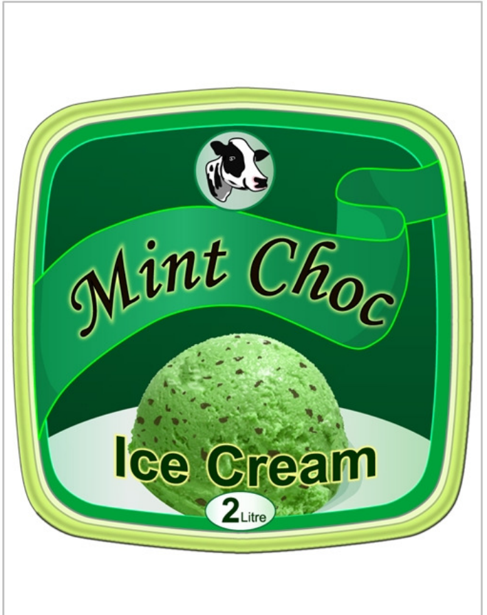
CD RO CDRO Licence Personal Use AHP-A0-6/2015 Expiry date: 31 Dec 2019