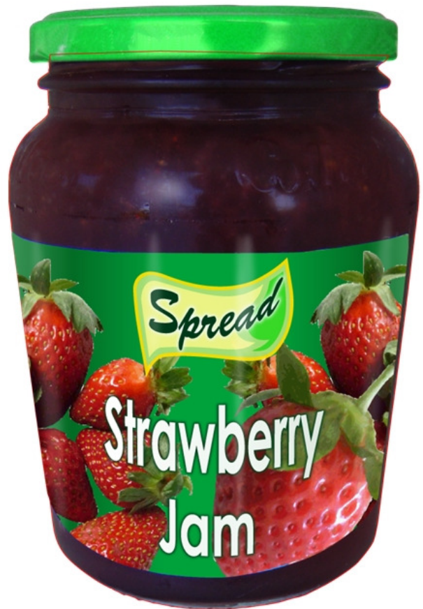
CDRO CDRO Licence Personal Use AHP-A0-6/2015 Expiry date: 31 Dec 2019