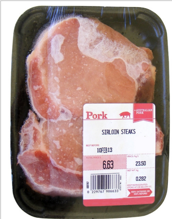
CD RO CDRO Copyright—John Austin © Australia 2017. Licence Personal Use AHP-A0-6/2015 Expiry date: 31 Dec 2019